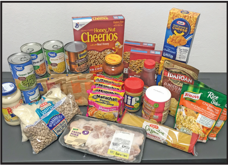
Food items from the Nolan Terrace Apartments Angel Food Pantry are available on Wednesdays this month from 1-3 p.m. via an appointment. Call (830) 875-3833 for more information.